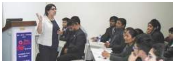
Chai Pe Charcha