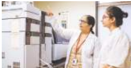
LC-MS/MS (Liquid Chromatography / Mass Spectrometry)