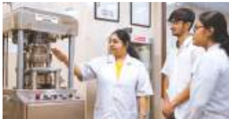
Pilot Plant (A small scale manufacturing Unit)