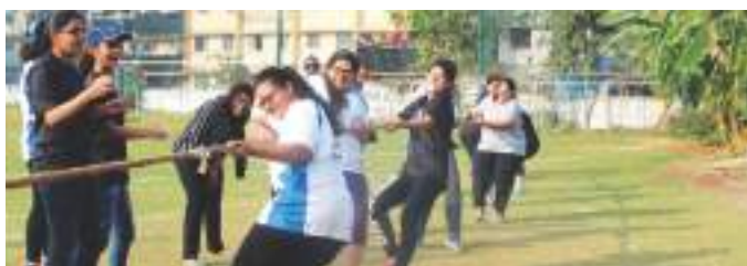
Excaliber Sports Event