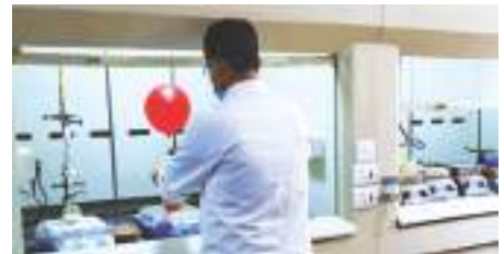
Cell Culture Facility – Research Facility