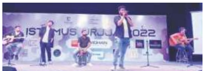
Isthmus (Corporate Event) – Urjja (Cultural Event)