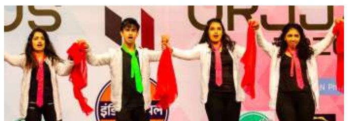
Isthmus (Corporate Event) – Urjja (Cultural Event)