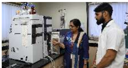
LC-MS/MS (Liquid Chromatography / Mass Spectrometry)