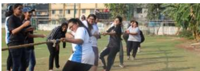
Excaliber Sports Event