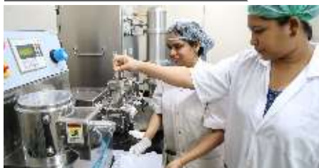
Pilot Plant (A small scale manufacturing Unit)