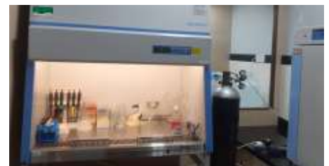
Cell Culture Facility – Research Facility