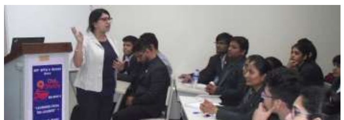
Chai Pe Charcha